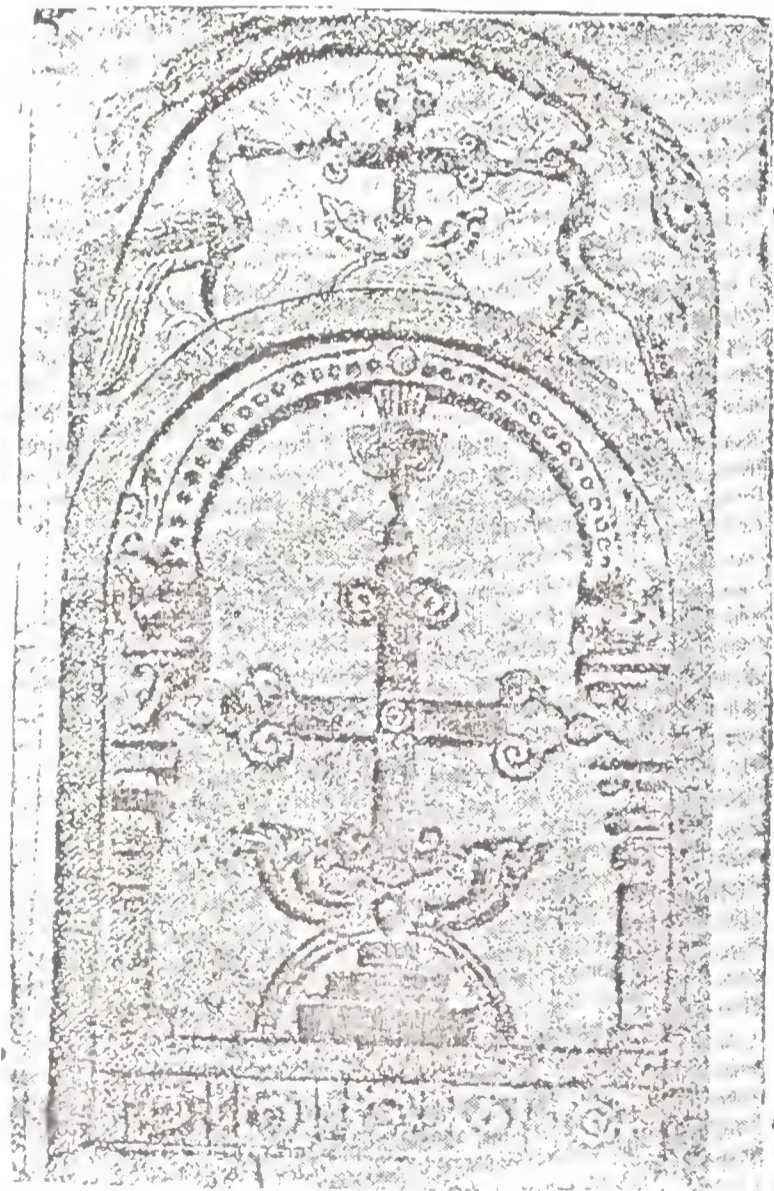
The Big Cross at Valiyapally Kottayam, 10th century

The next important circumstance of which there is historical proof is the political independence which the community enjoyed in the tenth century. It is said that they so