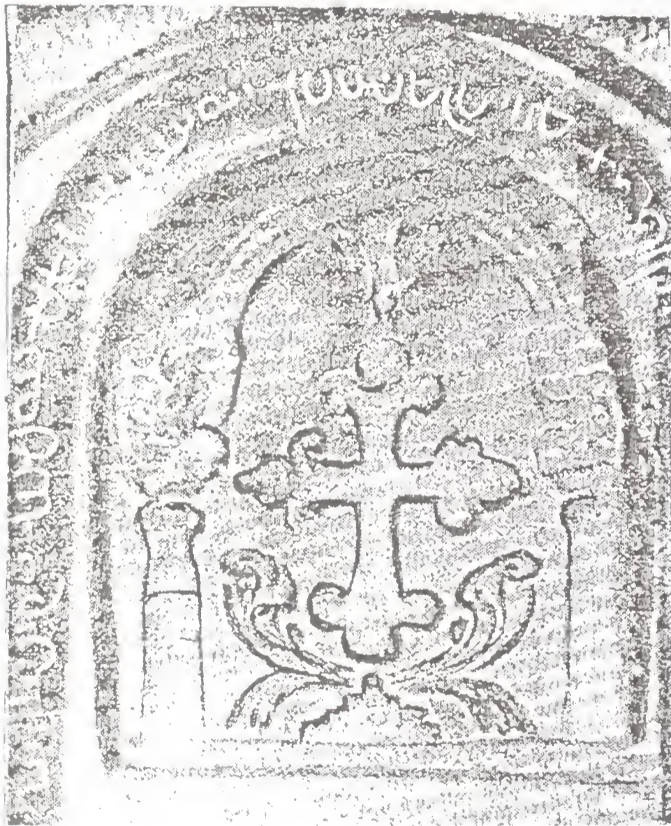
The Stone Cross at St. Thomas Mount, Mylapore , 7th century

As a parishioner and trustee of the old Church at Kottayam, we had, and still have, ample opportunities to compare the two crosses there. Though we are ignorant of the Pahlavi language, our comparison enables us to say definitely that both crosses contain the same Pahlavi inscriptions in their entirety, with the difference that in the more modern one the writing is "in a sort of running hand" and there