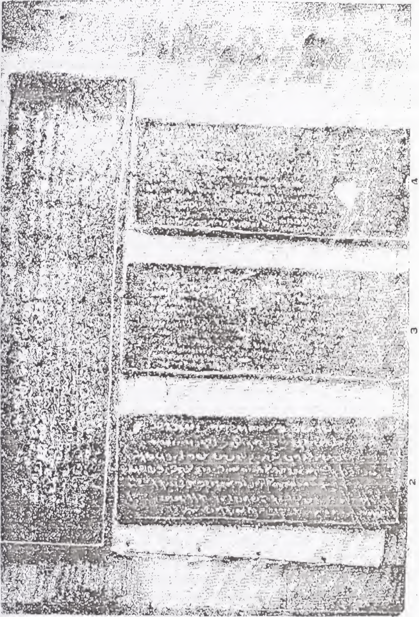
The Copper plates of the Syrian Christians of Kerala